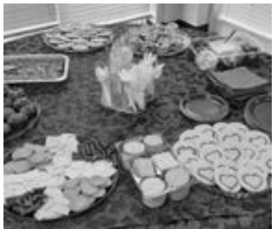
An LWML Sunday to remember at Grace Lutheran, Murfreesboro.