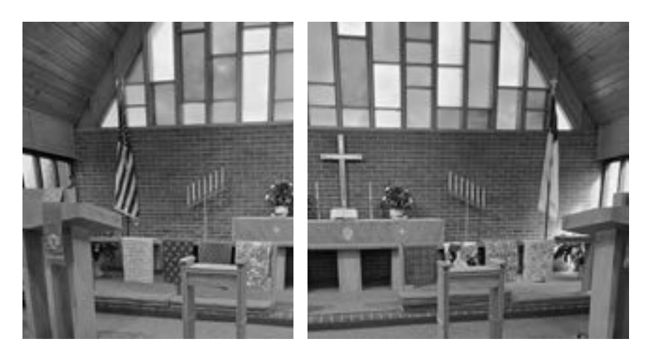
A beautiful display of the quilts and lap throws made by the ladies of Faith Lutheran Church, Tullahoma, Tennessee.